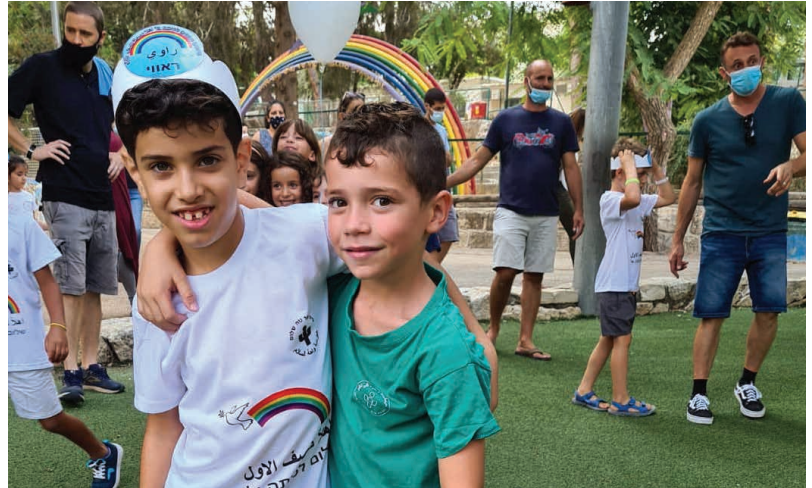
Masks came off for a photo-op moment.

Additionally, funding has been secured to update and upgrade the playground, something to look forward to when students are able to return. In the meantime, we are so grateful to report that