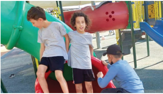
PS children in their playground.