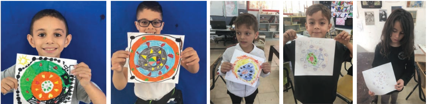
1st and 2nd graders display their mandalas.

PS students watched videos of Tibetan monks making sand mandalas as part of a “Citizens of the World” program, e-touring cities all over the world. Making their own mandalas and learning about their spiritual meaning was a favorite activity.