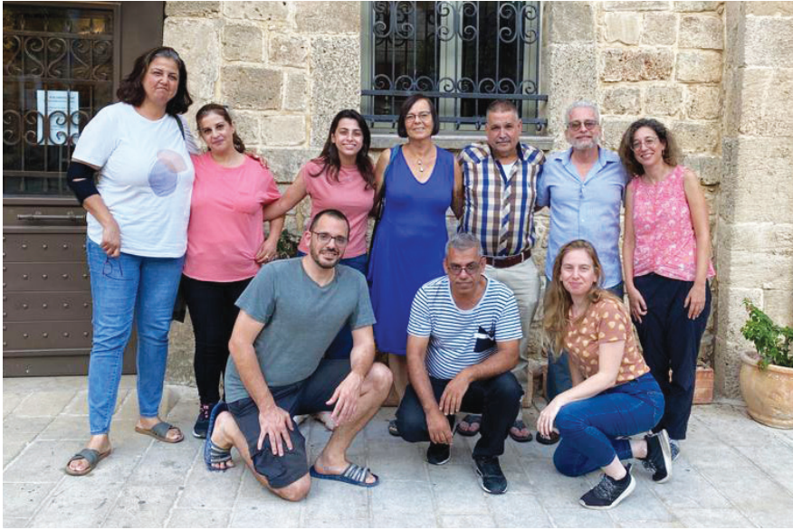
The SFP is broadening its reach with alumni, participants, partners and academic institutions.

The Binational Educators' Forum at the School for Peace took a hard look at the separate Jewish and Arab educational systems in Israel and investigated how this split system has contributed to the current conflict in the mixed cities, to prejudices and preconceived notions about the opposite group. This vital event included the Primary School teachers alongside educators from across the country and was an outgrowth of both the HOTAM teacher training and the Mixed Cities course offered by the SFP. This is precisely the kind of