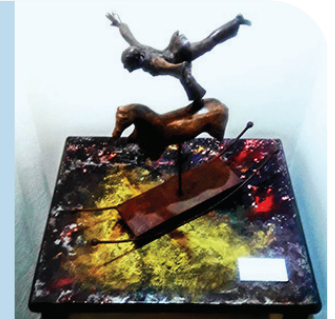
Art work by Dan Reisner.

In the next month, the Peace Art Gallery will host a 16-day event to raise awareness about gender-based violence, showcasing Palestinian and Jewish artists who grapple with this important issue. The next show, “Global Climate Scream” will run into the new year. The struggle for equality and the changing climate are inextricably linked as students and artists see the harm climate change is causing across cultures and for individuals, and envision improved systems and more sustainable models of living for the future. This exhibition will display the work of Arab and Jewish Israeli artists engaging with that reality. In addition to January’s closing event for the show, the Gallery will be host two events spotlighting two Tel Aviv artists, in collaboration with the Tel Aviv Museum of Art Youth Section.