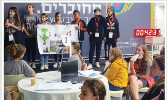
Students demonstrate their work at the competition.

A large group of 5th and 6th-grade students participated in the Hekton Competition in Mateh Yehuda. The students presented ideas to help inspire Jewish students to learn Arabic, enhance the relationship between students and the environment, and make school a more interesting and enjoyable place for students.