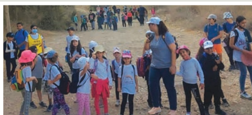
Students and teachers out in the olive fields.