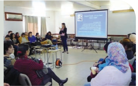
Classroom specialized training session.

Specialized trainings and Arabic instruction for the teachers continues, with more collaborations with other bilingual schools and teachers planned for 2022. In the coming years, the school looks to expand into the high school grades, providing an increasing number of regional youth with a full multicultural educational experience that will prepare them to be ambassadors of conflict-transformation, mutual respect, and peace-building throughout their lives. Making this dream a reality will require hiring and training additional teachers, as well as scholarship funds for students in need. We hope you will consider a gift in support of this well-planned and nationally significant model.