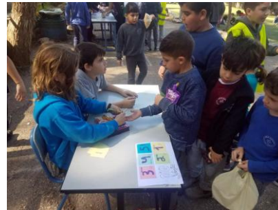
Students enjoy music and game-time.