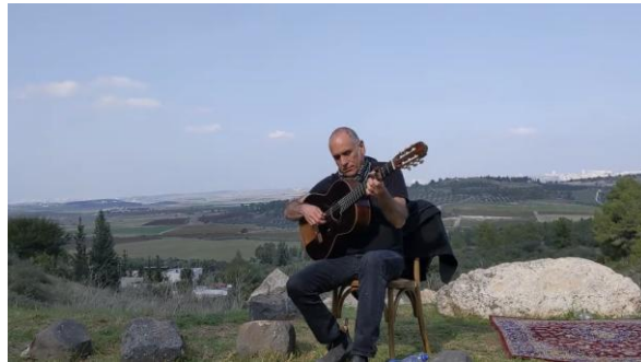
David Broza, 2020

From heartfelt Zoom meetings with our Italian friends in April to classic film screening to a 20-person outdoor concert by top Israeli musician David Broza in the Fall, the staff and supporters of the Spiritual Center called upon their ingenuity to continue offering an impactful and inspiring calendar of programming for members of the Village and supporters around the world. As we all begin to gather together again, we have loss and grief to process - but we also have the joy of reconnection to celebrate. In 2021, the Spiritual Center continues to build bridges by hosting the Religious Leadership Program alongside Rabbis for Human Rights and support community by programming special events and theater presentations to coincide with holidays. A primary goal for 2021 is the remodeling of the Rescuers & Sculpture Garden and the planning of a ceremony to honor Jewish and Palestinian people who have acted with outstanding courage to save the 'other' during the years of conflict.