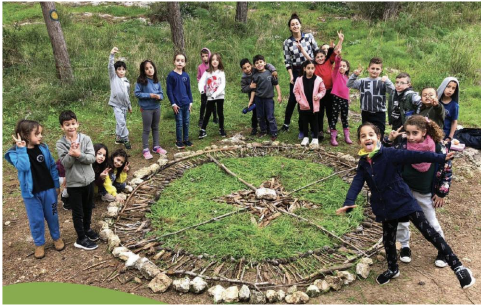
The Primary School youth inspire us all.

Even through a tumultuous and challenging year, NSWAS continues to grow and develop in each of their compelling and productive projects and departments. 2021 plans are bold yet considered, and with the support of friends the Village will meet its goals. Wahat al-Salam – Neve Shalom (WAS-NS) is a Village of Palestinian and Jewish citizens of Israel dedicated to building justice, peace and equality in the region and the country. Every day, we work to support this vision as their American friends. Through this work, and with the support of generous benefactors and partners, a durable, sustainable peace will be built for the generations to come. If there is one lesson that the Oasis of Peace can teach us from 2020, it is that together, we can meet any challenge.