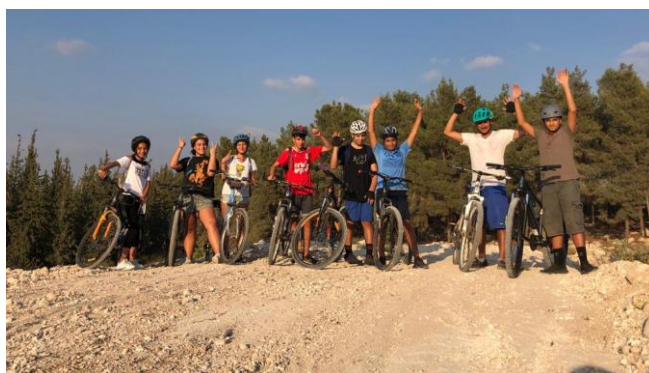
Young people from the village took part in varied excursions such as the Film Bus, bike trips, and more!

Summer programming included an overnight camping trip, theater workshop, and a forest bicycle trip. In Fall, they collaborated with Tel Aviv University to host ten volunteer students who taught the young people filmmaking skills. Together, they produced a film in which they interviewed several long-term village members. Afterward, a screening of the completed films was held outside on the Primary School grounds. Later, the youth helped organize a fundraiser for inhabitants of a shelter for battered women.