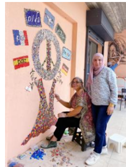
Outdoor mosaic art celebrating peace.