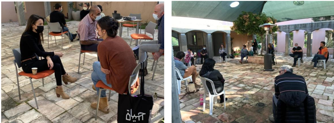
Masked, outdoors, and distanced, students work toward powerful solutions at the School for Peace.

Even through the closures necessitated by the pandemic and the loss of the SFP's main gathering space, the work of pursuing peace and justice has not slowed, not by a long shot. Ongoing meetings of the Change Agents for Theater and Cinema course, Environmental Justice Course, Change Agents Training Course for Lawyers, and Arab-Jewish Forum for Planners have all taken place in the last six months, among many others. These ongoing programs train and encourage a variety of professionals to create the sort of cross-cultural collaborations which will build sustainable peace.