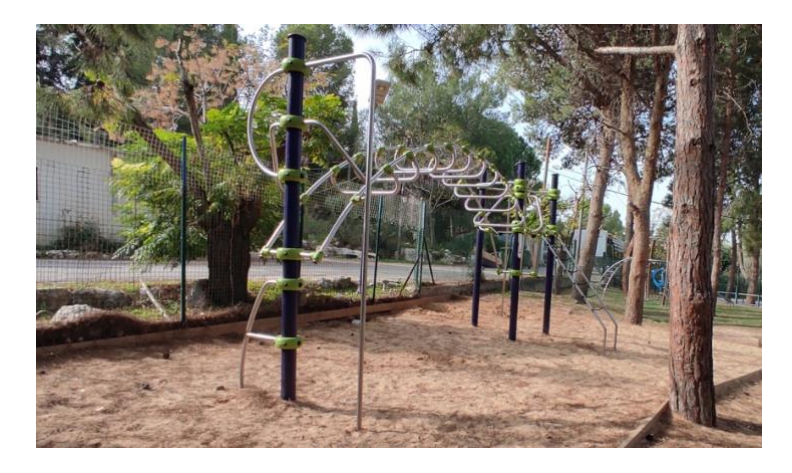
Areas 1, 5, and 3 of the new playground. Areas 2 and 4 will be completed in 2022.