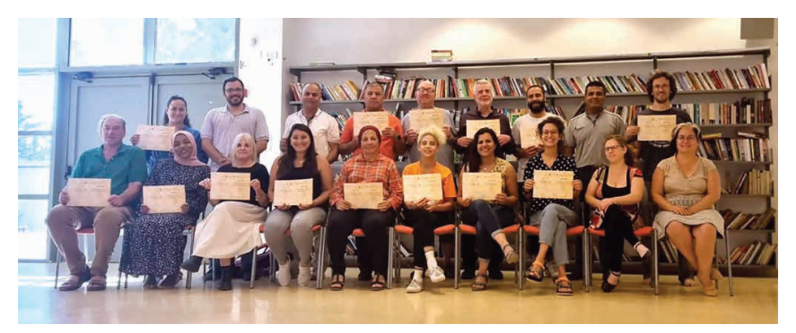
SFP students pose with their completion certificates.

The SFP continues a recordbreaking year, conducting university courses at six different institutions, providing opportunities for dialogue between Palestinian and Jewish students who study together, but rarely speak honestly together about their shared political reality. The Nakba Tour Guide Course that ended June 24th included eleven sessions with