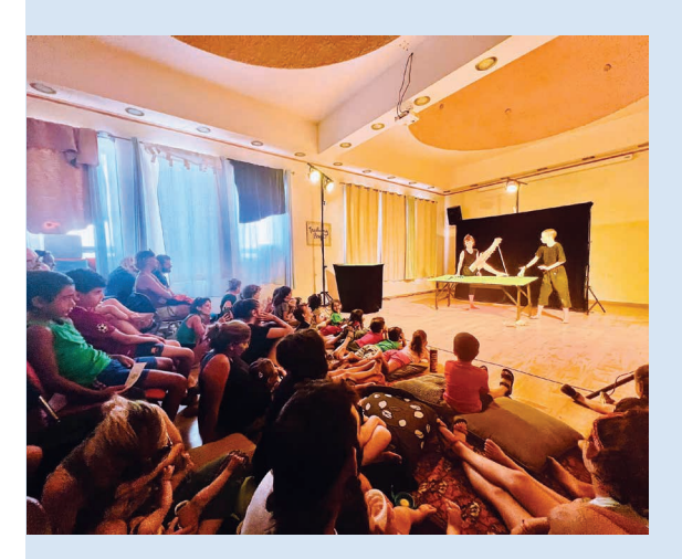
Students perform for the community.

Change does not happen overnight, but this long-term, wide-ranging set of projects spearheaded by the School for Peace is precisely the sort of thoughtful and collaborative change-making the American Friends make it a point to support. Already the project is making a difference in the lived experiences of those in Mixed Cities, and we look forward to reporting further on their progress in the coming months.