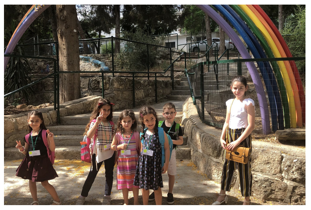
A group of students pose for a photo under the rainbow arch on their first day of school.

AFNSWAS raised $13,172.00 for the Primary School this summer as part of the Adopt-a-Class program. Thank you for your dedication to these children and their education.