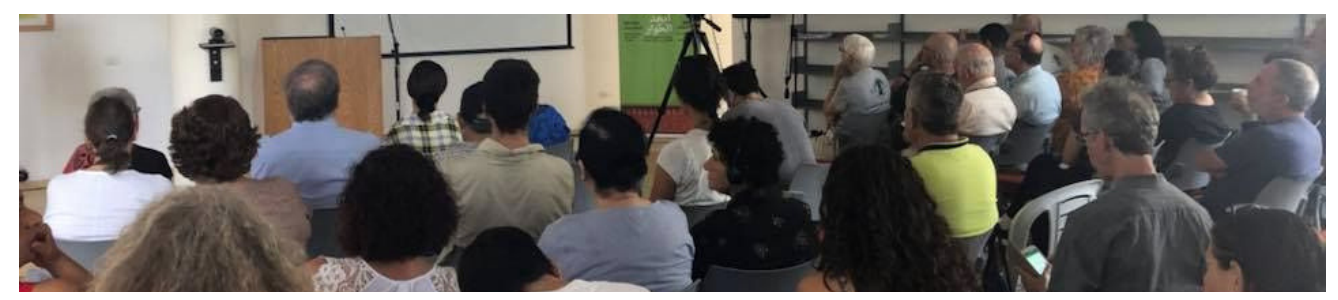
Conference workshops combined a practical demonstration with group work.

On October 15, peace activists from all backgrounds and walks of life gathered in NSWAS for a day of education, community-building, and connection. The event? "Beyond Dialogue: Nonviolence and Social Action," a conference first conceptualized by and then fully funded by the Topol Family Foundation.