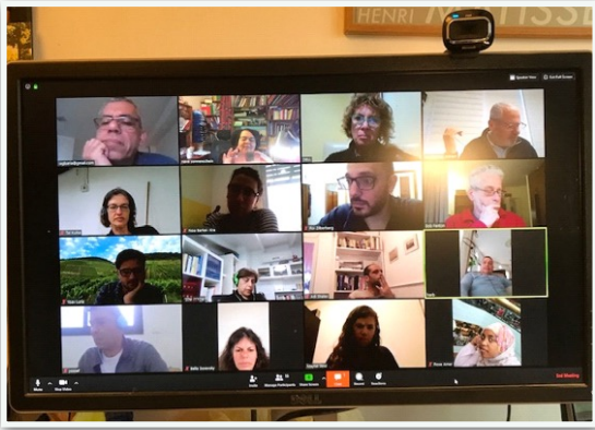
Change Agents Zoom Meeting