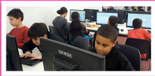
School computers can't go home. Laptop tablets can