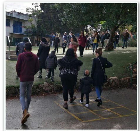
New parents meeting at the school.

Your support increases the Primary School's capacity, providing space for the parents and children who are creating their shared future, bilingually and multiculturally, grounded in equality and peace-building.