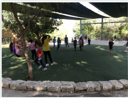
Children in the playground area.

In challenging times like these, a playground is more important than ever. With the Primary School now operating virtually, playing with friends is a treasured memory for the children of NSWAS. It will be the first activity they will return to when schools reopen.