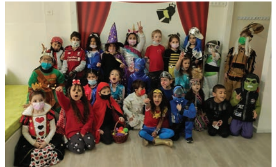
From our Purim celebration

In March, the children celebrated Purim. In accordance with COVID regulations, each class celebrated the holiday in separate capsules. Currently, many students are observing Ramadan, and their teachers ensure these students are supported throughout this special period. Whether or not children are fasting during Ramadan, the Primary School also celebrates Girgian. This festival is celebrated halfway through the Muslim holy month to reward children for observing Ramadan, though all students participate in the festivities.